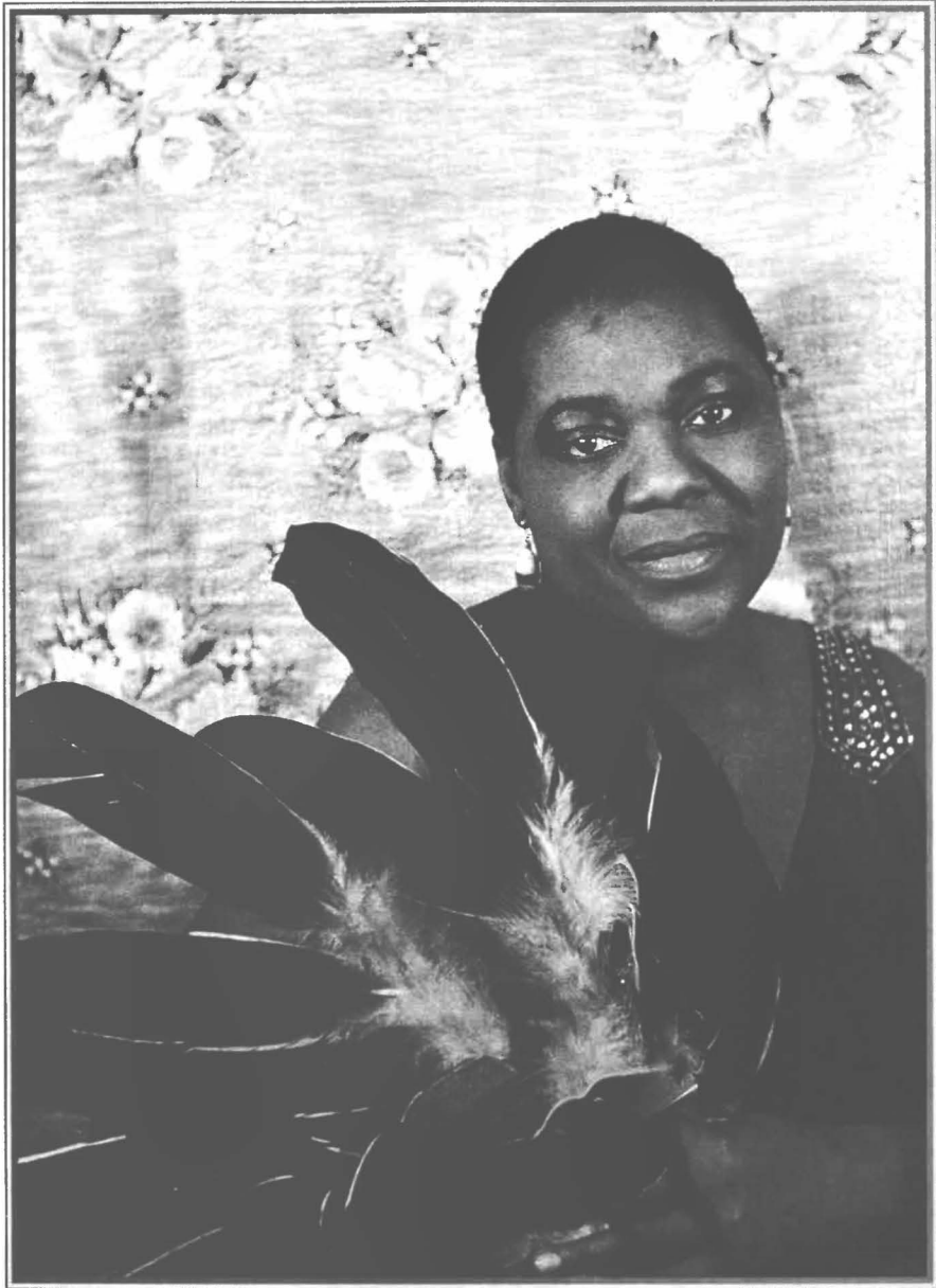
Bessie Smith figures in Harlem Renaissance history largely owing to Carl Van Vechten's desire to count her among the guests at his notorious parties. While his written accounts of her performances leave much to be desired, he made a remarkable series of photographs of her the year before she died.